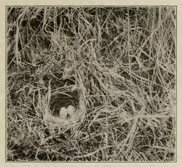
NEST AND EGGS OF GRASSHOPPER SPARROW

30. Molothrus ater ater. Cowbird. Altogether too common. The eggs are most frequently placed in the nests of redwings and bobolinks, although they are sometimes placed in the robin, yellow warbler, and meadowlark nests.